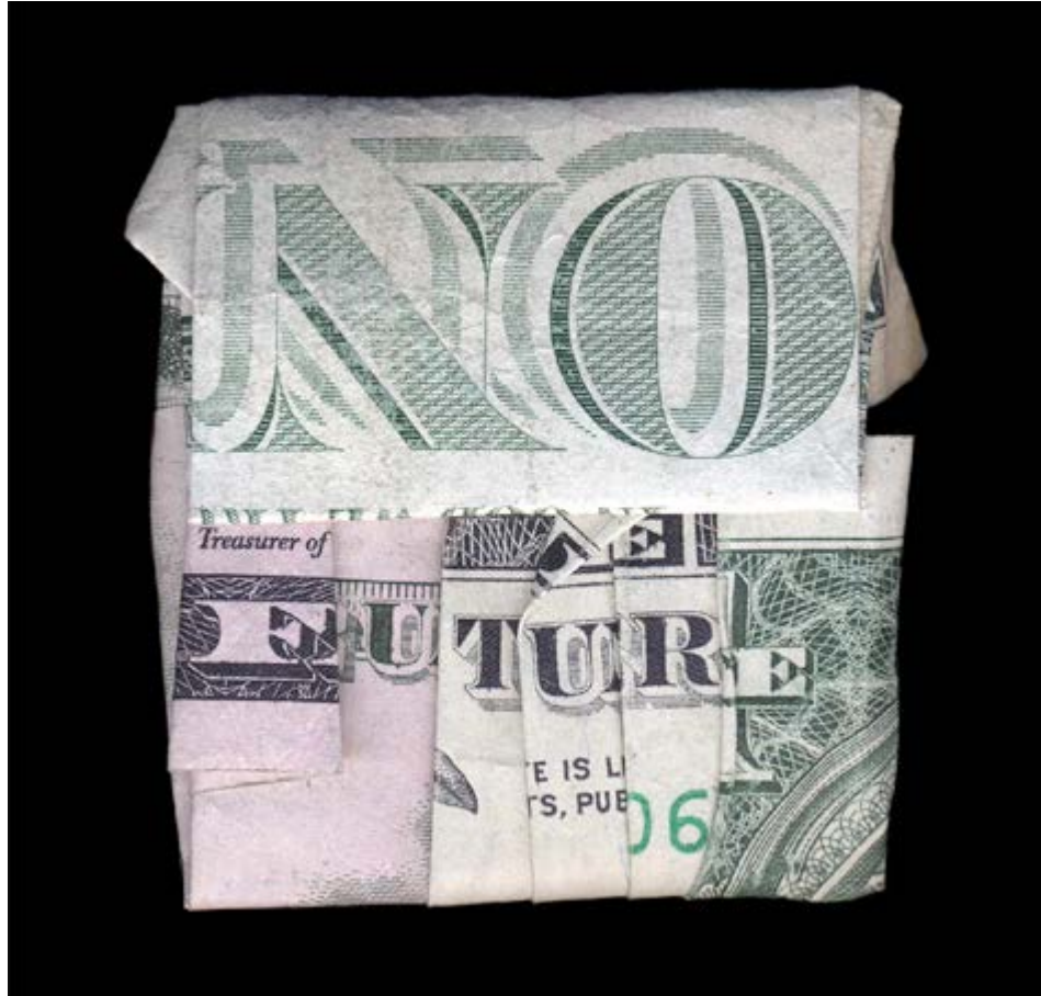
NO FUTURE, 2015 Photograph, edition of 2 151 x 151 cm - 59.4 x 59.4 in. Photograph, edition of 7 102 x 102 cm - 40.2 x 40.2 in.