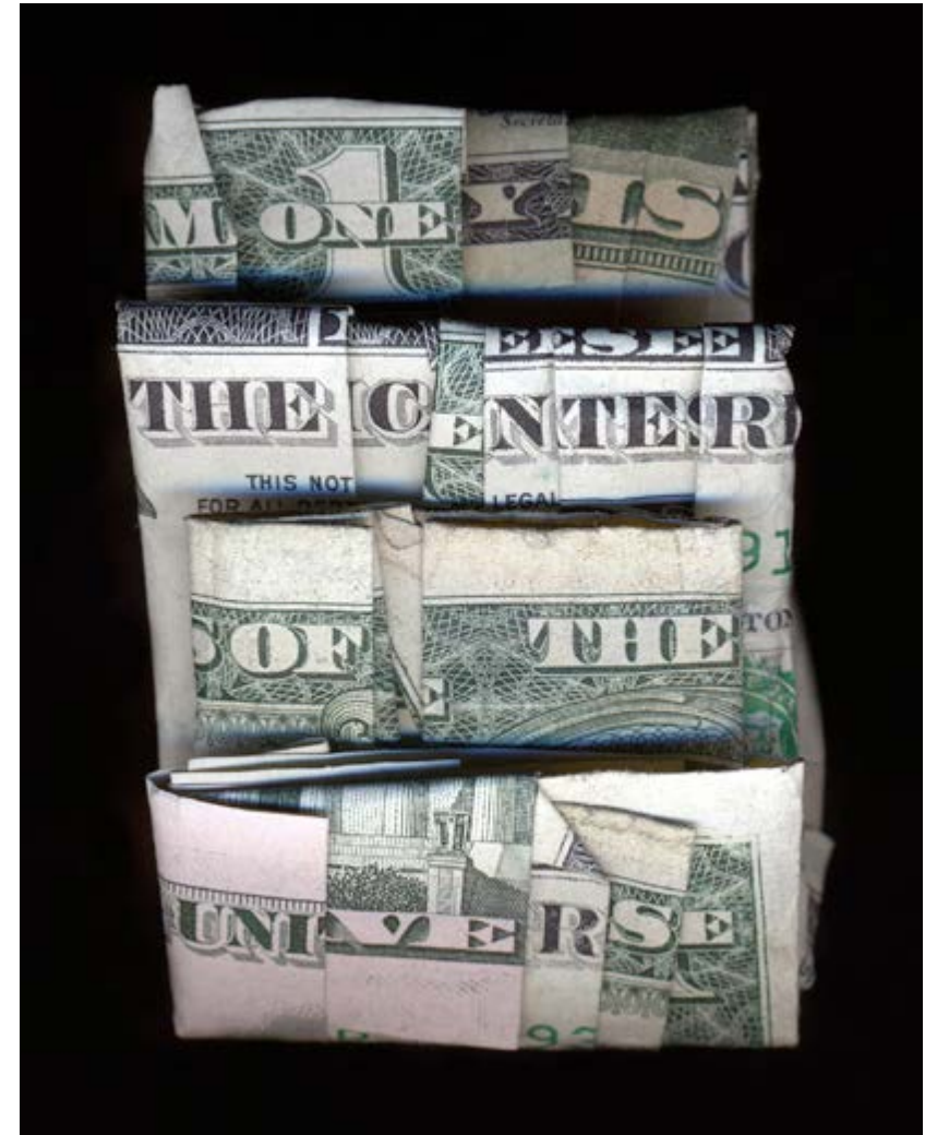
MONEY IS THE CENTER OF THE UNIVERSE, 2015 Photograph, edition of 7 102 x 127 cm - 40.1 x 50 in.